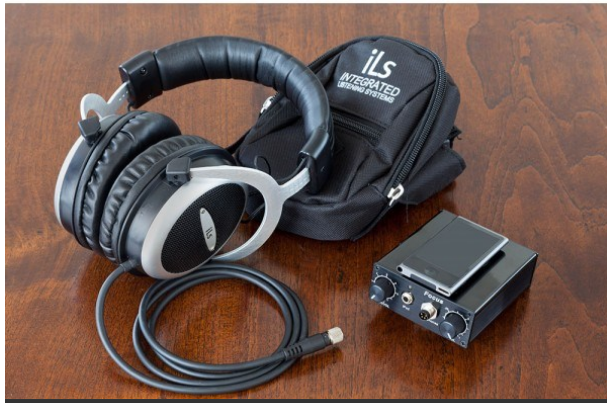
iLS Student Focus System for School Program use